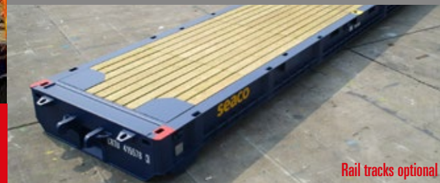
Rail tracks optional